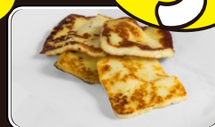
Grilled Haloumi Cheese