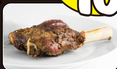
Single Lamb Shank