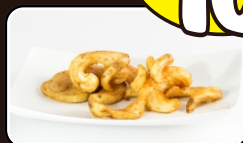
Beer Battered Sidewinders